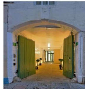
Entrance to Ship Street Centre