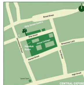
Map showing location of Ship Street Centre